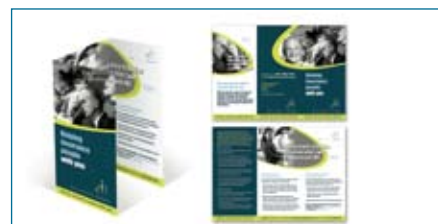
• Leaflets: do they work for your institute?