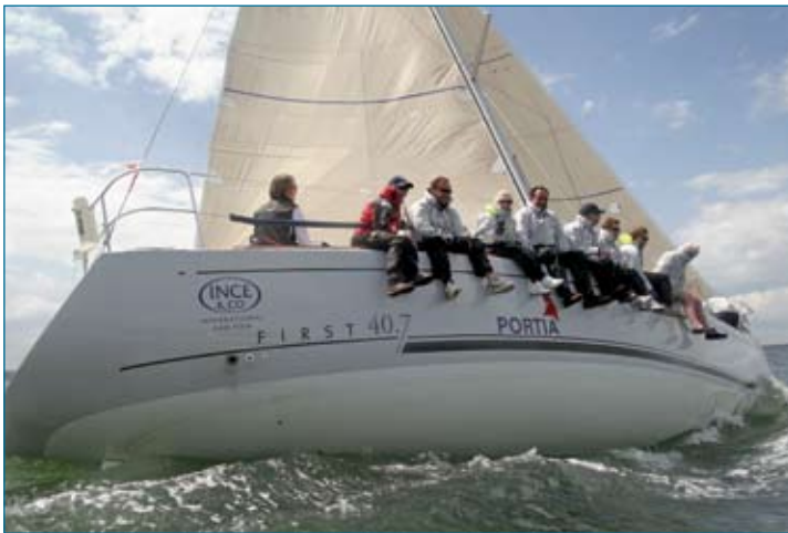
• Ocean Wave: one of the crews in last year's regatta taking a breather.